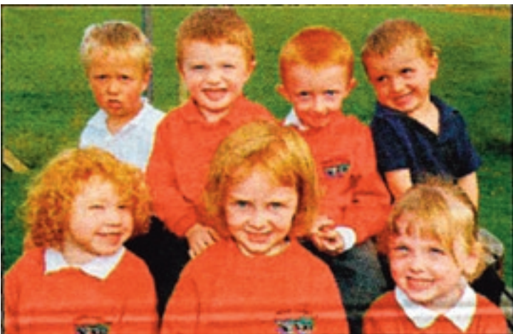
Ysgol Carrog's new starters making friends